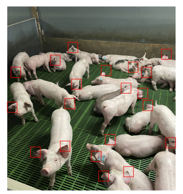
Fig. 1 Example of pigs evaluated during the experiment. Red squares indicate ears with necrosis lesions