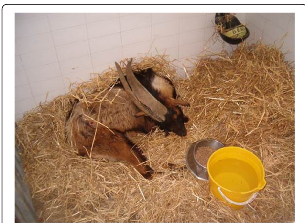
Figure 1 Neurologic signs - buck showing signs of hind limb paralysis and self mutilation (skin excoriation on abdominal flank) due to hyperaesthesia.

Rectal temperature, heart and respiratory rates were inside the reference ranges. Blood analysis revealed leucocytosis characterized by a neutrophilia and monocytosis, moderate anemia and hyperproteinemia (Table 1). Renal and liver values were normal. Radiography of the lumbosacral region were unremarkable. Cerebrospinal fluid (CSF) was collected by lumbar puncture under local anaesthesia. The fluid was clear, colourless and did not flow freely from the needle hub. CSF analysis showed severe mixed pleocytosis (980 cells/mm 3 ; 65% neutrophils and 35% lymphocytes) with mild increase in protein concentration (1.15 g/L). No cryptococcal organism was identified and bacteria